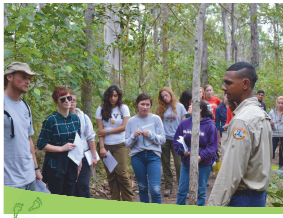
Mandingalbay Yidinji Rangers working on their native title lands.