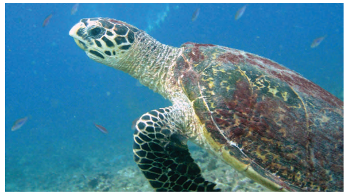
Torres Strait has a globally significant population of Hawksbill turtles.

The wetland ecosystems of the Torres Strait region are not well documented with little information on wetland types (e.g. mangroves, salt marsh and freshwater) or the status or condition of their biota. Many islands are low lying and the predictions of sea level rise and increased storm surge frequency mean that mangroves and coastal wetlands may be among the most threatened ecological communities in Torres Strait. This project establishes a baseline of the status and condition of mangroves and freshwater wetlands habitats and documents existing knowledge of selected communities with regard to their use of these habitats. The purpose of this research is to assess climate change related mitigation options for mangroves.