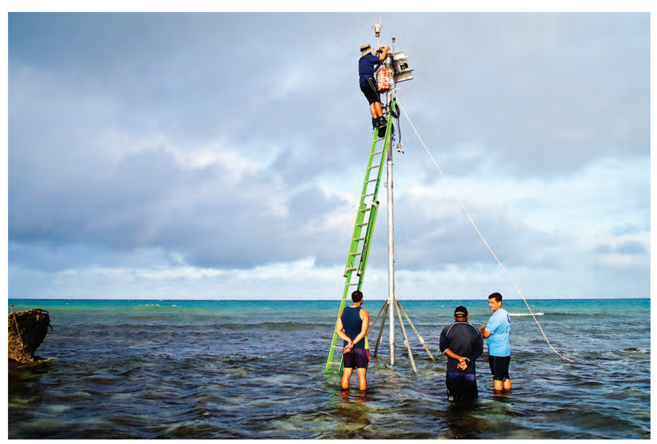
The installation of a real-time weather and ocean observing station at Masig in July 2013 will help deliver improved bleaching forecasts for the Torres Strait in summer as well as help locals with local weather data to make boating safer.